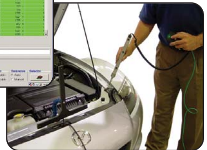
Point-to-Point underhood measuring is made simple with pinpoint visuals provided by system software