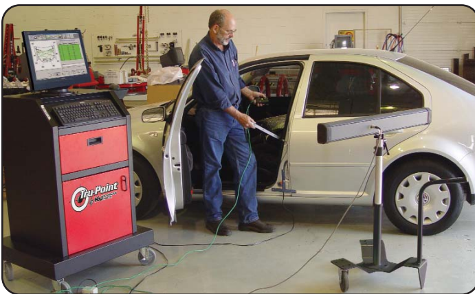
Lower Body and Upper Body measuring is done with a single hand-held probe (no bridges)